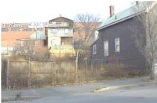
Example of a Vacant Lot

Objective 1.h: Promote Portland as a Pro-Housing Community.