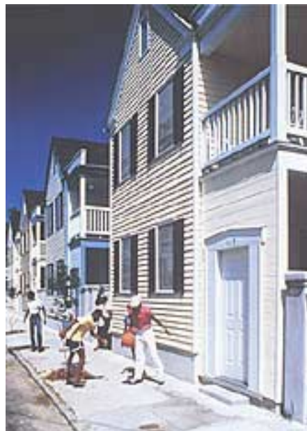
Example of infill development