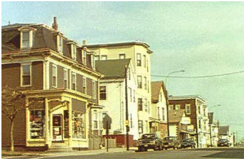
Congress Street on Munjoy Hill