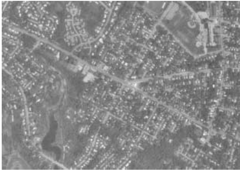
Aerial of Rosemont Neighborhood