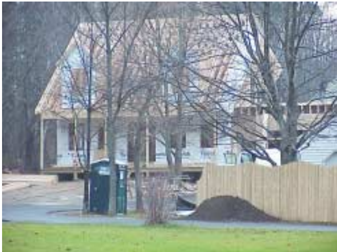
Single family construction in North Deering