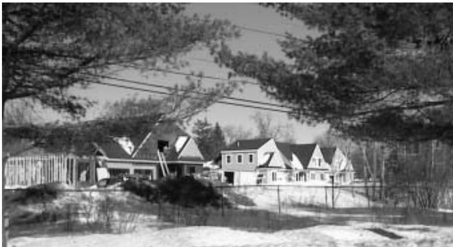
Planned Residential Unit Development off Allen Avenue