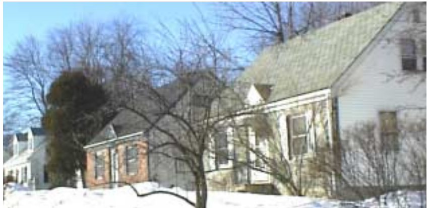
Traditional neighborhood with small cape style homes off Ocean Avenue

Objective: 1.f: Ensure that a continuum of housing is available for people with special needs and circumstances ranging from emergency shelters and transitional housing to permanent housing (rental and homeownership), which offers appropriate supportive services.