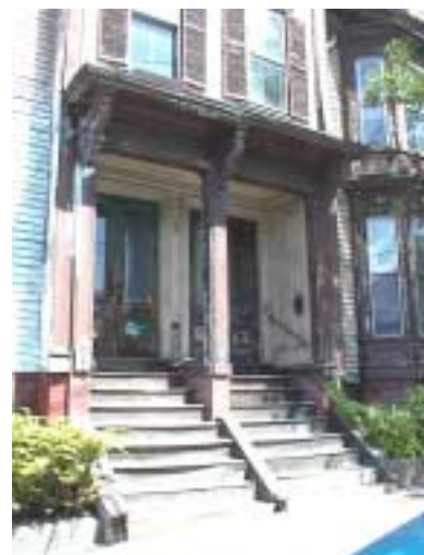
House in need of repair

A significant percentage of Portland's housing stock was built prior to 1939. While much of it has been renovated and rehabilitated over the years, preserving this stock is an ongoing responsibility. Safety is a concern with an older housing stock, which may need to be upgraded to address lead based paint and fire safety hazards. At the same time, concerns have been raised about institutional expansions, which have converted or demolished housing or purchased residential structures only to neglect them until they are a blight in the neighborhood. Housing is a critical component of the city's infrastructure. Any redevelopment initiatives, commercial or residential, should result in a no "net loss" of housing for the city as a whole.