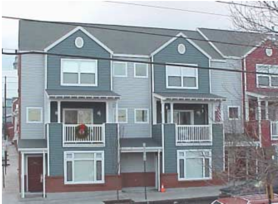
Unity Village on Stone Street and Cumberland Avenue