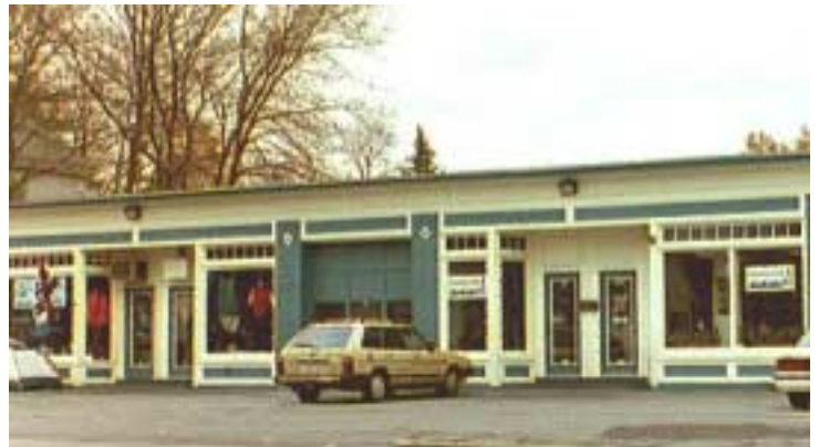
Neighborhood businesses in Rosemont

Objective 5.e: Locate and design housing to reduce impacts on environmentally sensitive areas.