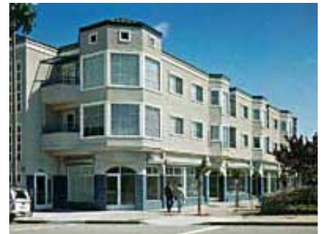
Example of commercial uses on first floor and residential units above.